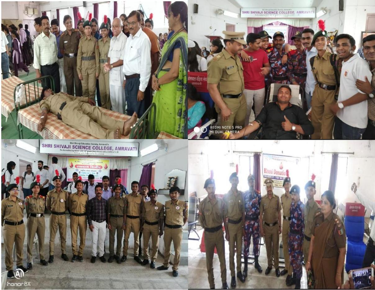
Blood Donation Camp Activity