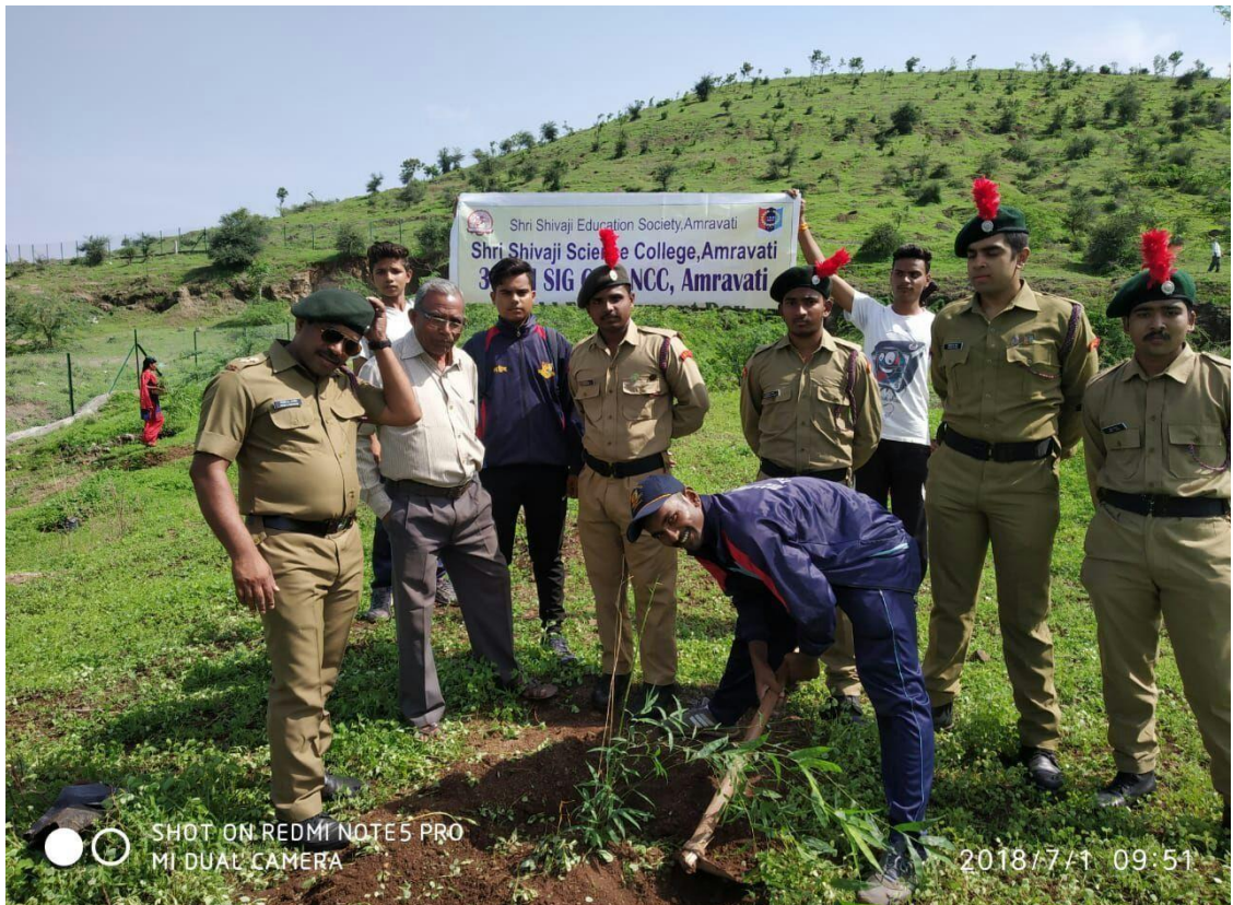
Tree plantation at North Wadali Forest (01/7/2018)