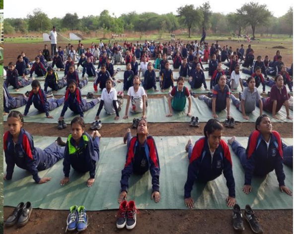
International Yoga Day (IYD)