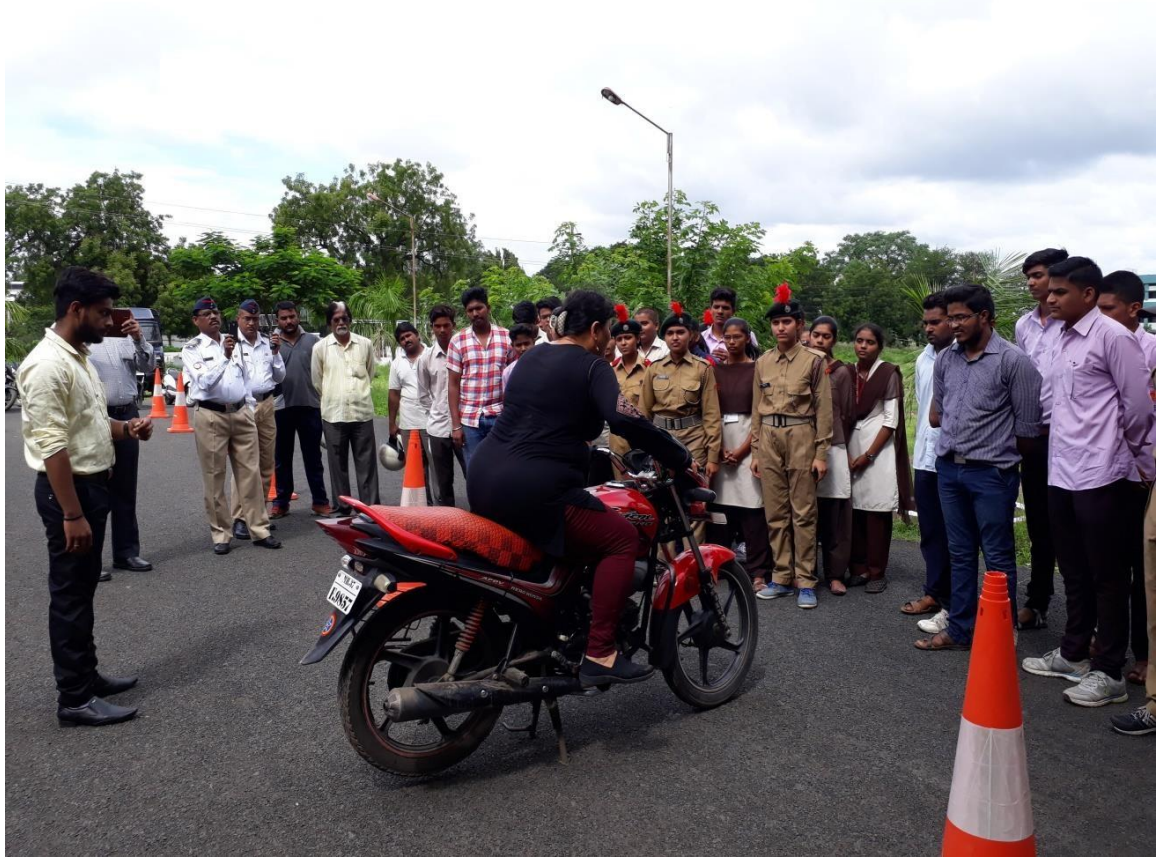
A Safe Driving -Road Safety Week (22/7/2017)