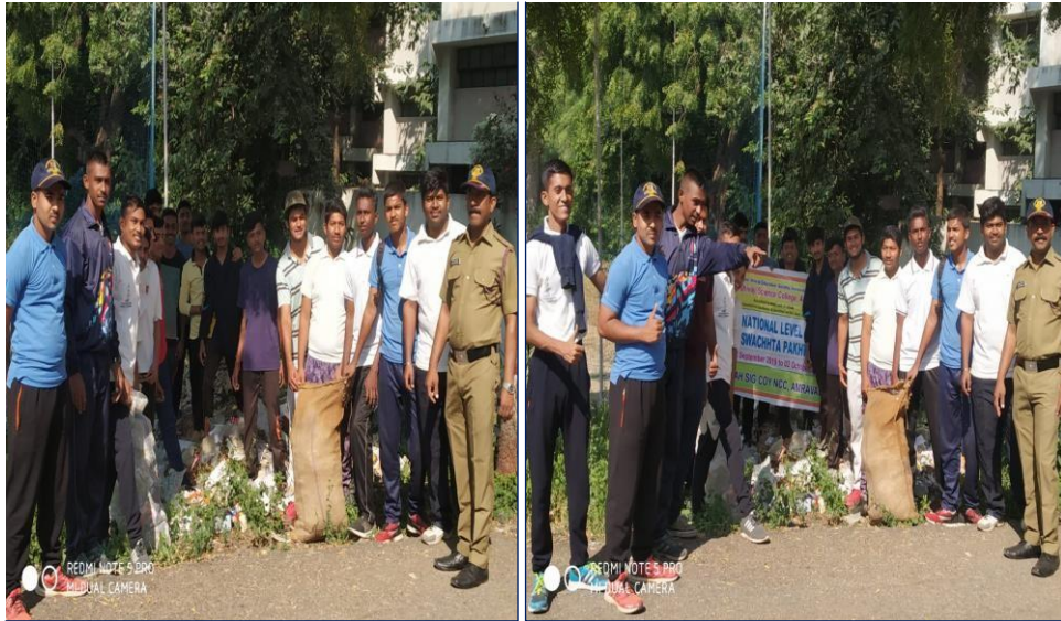
Swachh Bharat Abhiyan on the eve 150 th Birth Anniversary of Mahatma Gandhi