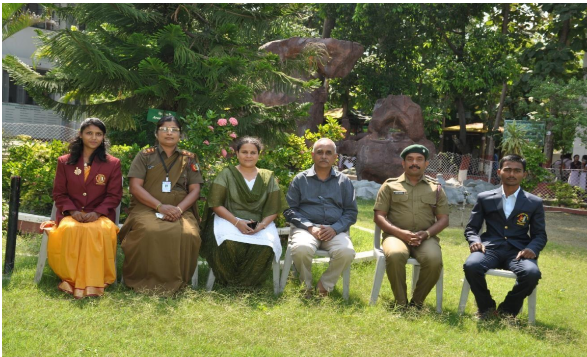
Felicitation of cadets by the Principal