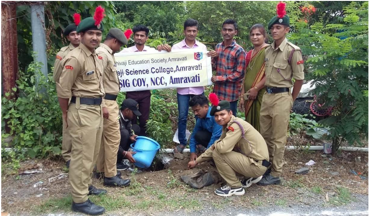
Tree Plantation at College Premises (10/7/2018)

The Principal and other staff planted the tree. The cadets were actively participated in tree Plantation.