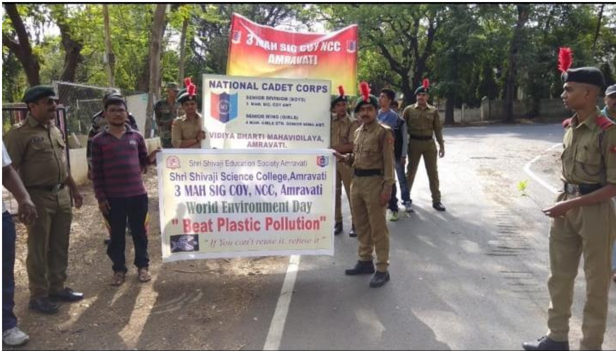
Beat Plastic Pollution Rally (5/6/2018)

All the premise of Vir Mangal Pandey Square was cleaned by cadets. Nearly 20 kg of plastic has been collected and disposed of. The cadets were also take part in rally with shouted slogan (awareness) up to Maltekadi.