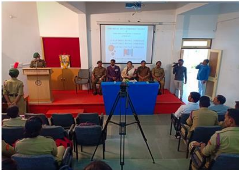
Guest lecture Organized the eve of "Kargil Vijay Diwas"